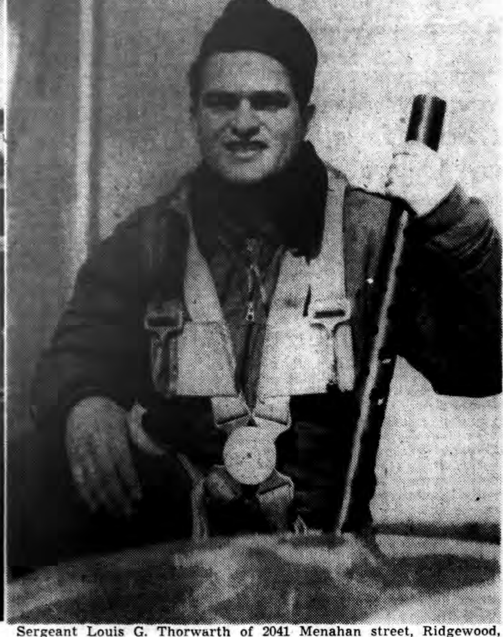
uses these twin machine guns in his Marauder bomber to strafe enemy troops and ground objectives singled out for attack by the Ninth Air Force.